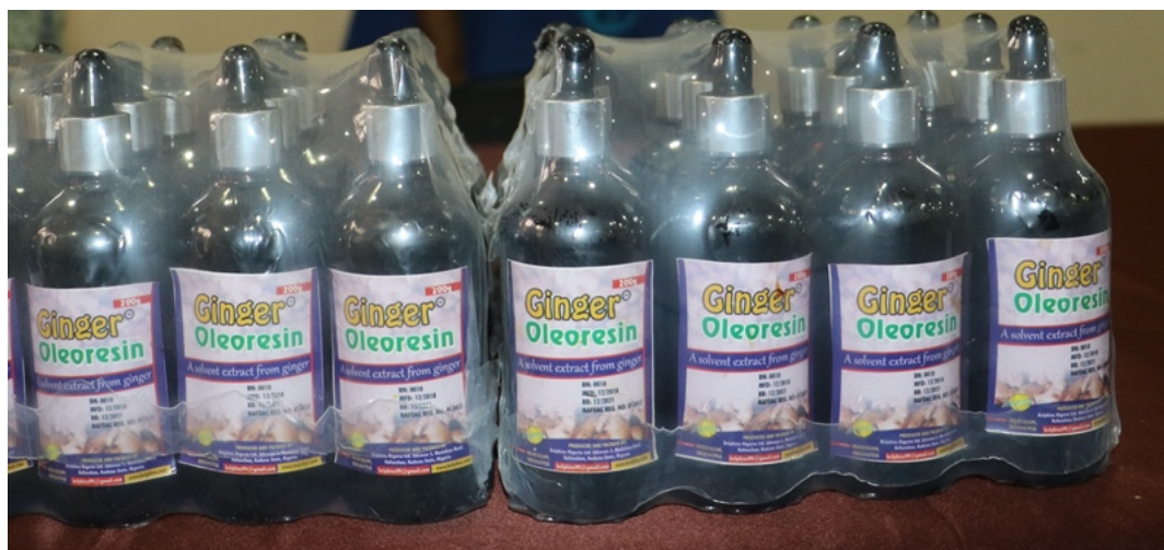
Figure 3: Samples of Ginger Oleoresin

The outcome of the analyses (Tables 4 and 5) formed the basis for a roundtable/advocacy meeting with the Organised Private Sector (OPS) for the utilisation of made-in-Nigeria ginger oleoresin by Nigeria's industries.