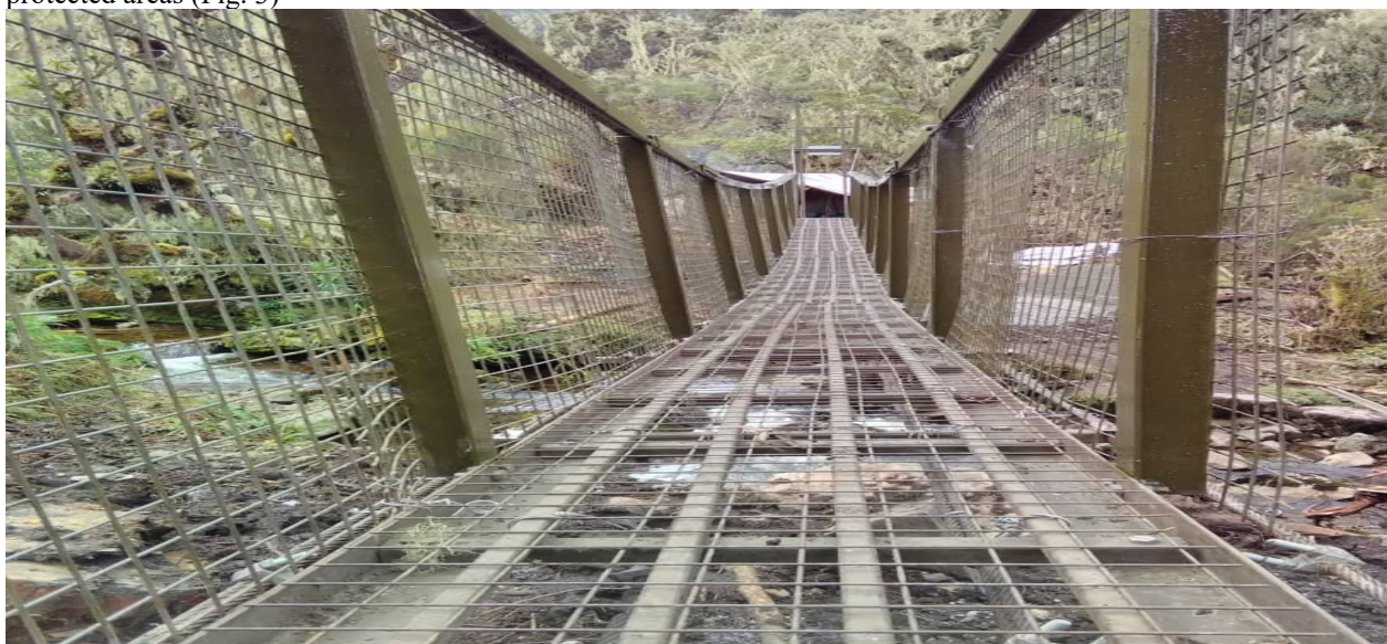
Fig. 3: Bukurungu Trail Infrastructure in Rwenzori Mountains National Park (Field photo)

The existing legal and policy regimes do not adequately capture various areas that would enhance biodiversity conservation, ( \chi^2(1, N=81)=9.351, p=0.001 , Cramer's Value=.416). These innovative conservation policy areas include ecosystem health, community involvement in wildlife monitoring, management of wildlife outside protected areas, management of biological corridors, Payment for Ecosystem Services (PES)—which should be considered key policy areas/issues for inclusion in the legal and policy frameworks to further enhance biodiversity conservation—, and regulating development of tourism infrastructure inside the PAs. Specifically, on the question of whether “increasing development of tourism infrastructure inside wildlife PAs conflict with conservation of biodiversity”, the results revealed statistically significant responses from park staff, ( \chi^2(1, N=81)=35.314, p=0.000 , Cramer's Value=.858, (Table 3), and the high Cramer's Value indicates a very strong effect. For instance, trails constructed in the parks interrupt the wildness and pristineness of the wildlife protected areas (Fig. 3)