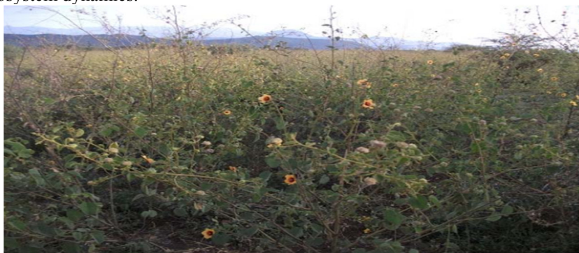
Fig. 7 widespread invasive species in the Nech Sar grassland plains.

While deforestation, overgrazing and over utilization of resources undertake on fragile ecosystems coupled with the current climate change, fertile grounds will be created for easily spread of invasive species which totally distress and dominate the existed ecosystem. Currently, there are many invasive species that are increasingly spreading around NSNP which have influence on the sustainable use and conservations of the park. Conservation of the natural ecosystems is the primary means to control the expansion of invasive species and regulating the ecosystem dynamics.