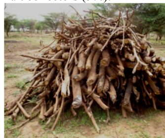
A. construction wood

Still now, in developing countries including Ethiopia forests are the primary source of wood to construction, and energy demand. Majority of Arba Minch town dwellers and almost all the rural population those are living around the park depend on the park to get wood for various uses (Schubert, 2015). Currently an average of 265 bundles with an average bundle weighs of 45 kg each fire wood & grass and suck of charcoal are daily extracted from the forest and enter to Arba Minch town. The 98% of Arba Minch town population demands 122.5000 kg fuel wood from 7500 hectare of natural forest which returning in the loss of 12.5 hectares of forest per year( discussion with park manager, June, 2018). Moreover, Aramde et al., (2012) reported that on average 147 people enter in NSNP per day and of these people the highest number engaged in fuel wood for collection with total share of 58%, followed by grass collectors (10%), split wood collectors (3%), pole collectors (5%), and fruit collectors (5%).