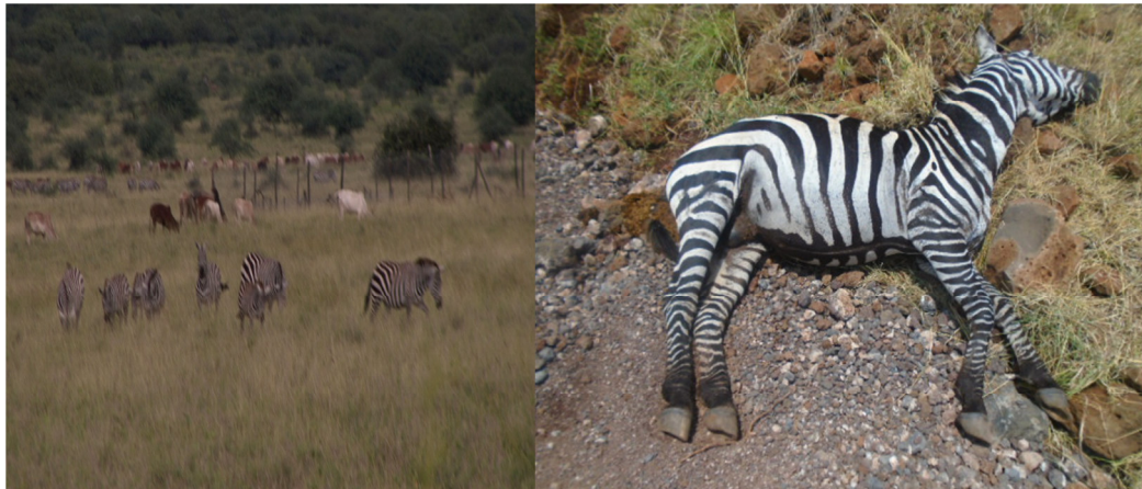
Fig. 9 sharing of grazing land between the wild and domestic animals (left) and death of zebra by transmitted diseases (right)