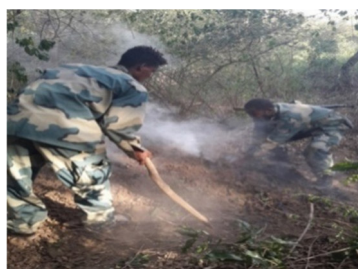
B. illegal charcoal production controlled by scouts