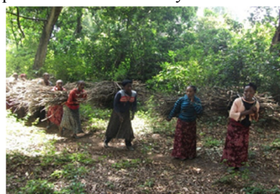
D. wood collector women from A/Minch town