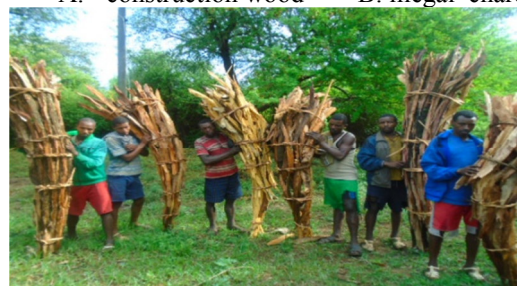
C. Illegal wood collection