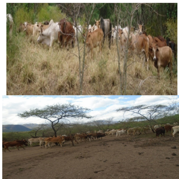
Fig.5 Encroachment of grazing land to forest areas © NSNP, 2018