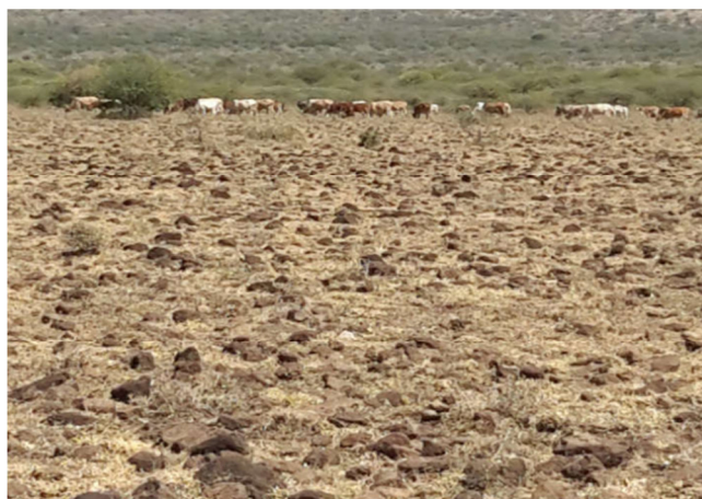
Fig.8 Habitat Destruction

These natural forest and wood lands are the habitats of important large and small animals. In NSNP, we found different animals: Zebra, Grant's Gazelle, Kudu and Lion. Despite to home services, the provision of food and water for these animals and birds is the other extreme importance of the forest and wood land (Lemlem and Fasil, 2006). However their habitat is currently being destroyed by the over-grazing of the cattle and deforestation for different purposes (Desallegn, 2004; Freeman, 2006&NSNP report, 2010 cited in Samson, et al., 2010).