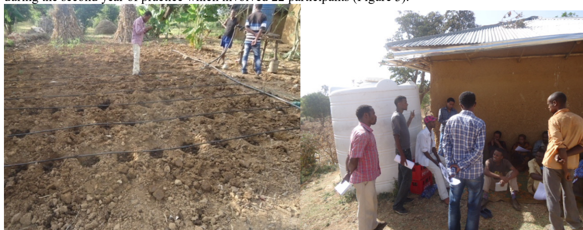
Figure 3: Installed drip lines and discussion with farmers to assess their perception towards the technologies, 2013

The demonstration and evaluation of roof top water harvesting for cultivating tomato was made at Sororo PA of Daro Labu district-on farm, for three consecutive years (2012 up to 2014) on one farmer as a demonstration, who actively participates and have house with corrugated iron sheet roof. On roof, side collectors and gutters were tied and appropriate site selected to place plastic tank storage. The collected water during rainy season was stored in the two tankers (8000 liters total capacity) for using during off-season for high value crop tomato (Cochoro variety) during three years of practice. The plastic tank and gutters was found from nearby suppliers and low-cost drip set which operates with gravity installed at 1m height above the ground using barrel to supply water for tomato. The land on which tomato seedlings transplanted was prepared and the study plots used were 16m 2 , 72m 2 and 42 m 2 respectively during three years of practice (Table 1). The data on yield (t ha -1 ), total selling price (birr), water productivity (kg/m 3 ) and farmers' perception towards the technologies were taken. Mini-field day was arranged during the second year of practice which involved 22 participants (Figure 3).