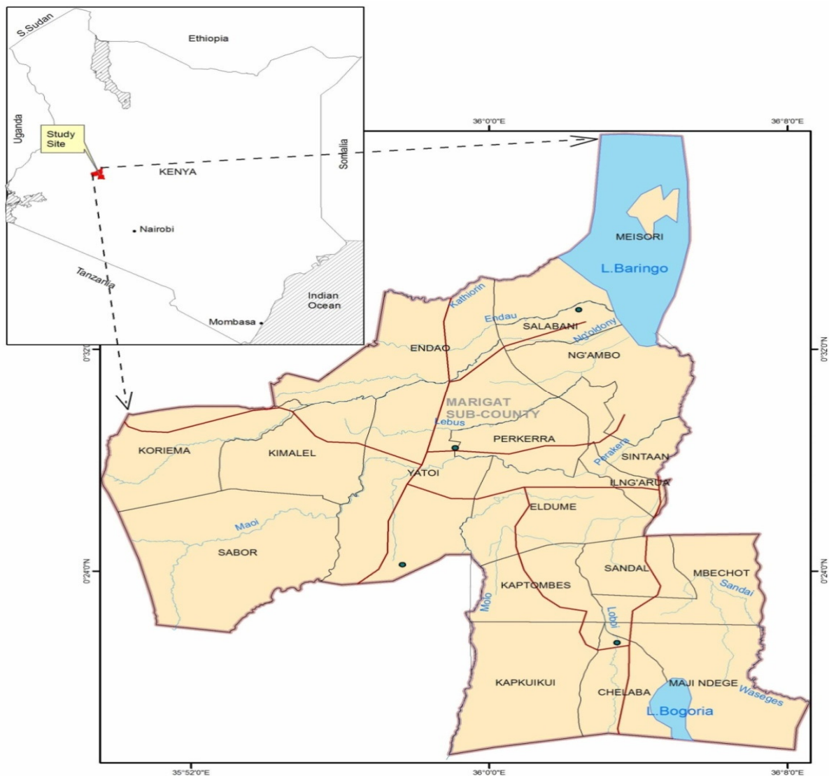
Figure1: Map of study area