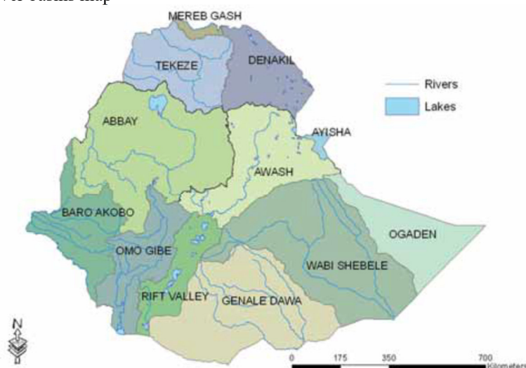
Figure 1. Ethiopian river basins map