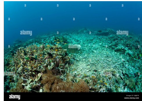
Plate 6: Dynamite fishing in the Niger