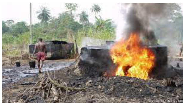
Plate 7: An unethical/illegal oil refinery in the Niger Delta

One of the major sources of oil spilling in Nigeria’s Niger Delta Region occurs through vandalization of oil pipelines either as a result of civil disaffection with/protest against the political process or as a criminal activity to obtain crude oil for illegal bunkering (unauthorized sale of crude oil to ships) or unethical refinement (Nwilo & Badejo, 2005). Whatever is the underlying reason for vandalization of oil pipelines in the Niger Delta, the activity leads to making fishing and farming livelihoods unsustainable due to ensuing oil spills. Unethical/illegal refinement of crude oil also leads to unwholesome release of carbon black soot which is dangerous to human health. Plate 7 below shows the open illegal oil refining process and the devastation it elicits on the environment.