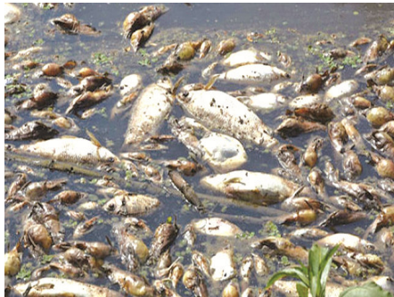
Plate 5: Dead fishes due to chemical fishing and spillage Delta