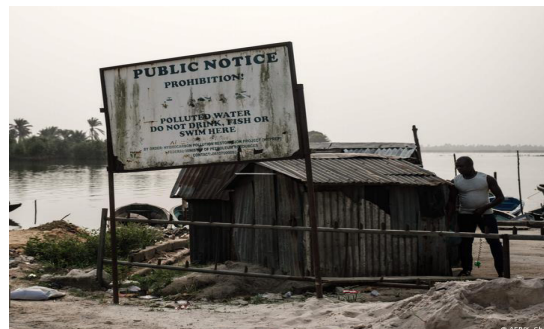
Plate 4: Water pollution from oil spills in the Niger Delta

Furthermore, during floods, which last for over half of the year in some areas, the waters are usually contaminated. This also negatively affects marine life and makes the waters unable to sustain vegetation due to petroleum hydrocarbon pollutants (Chukuezi, 2006). In addition, drinking water is scarce and in the dry season, safe water for bathing is usually not available – a situation that aggravates the risk of water borne diseases. Plate 4 below is an example of several oil polluted water masses in the Niger Delta Region which are barred from use with public notices supported with compliance monitoring security posts.