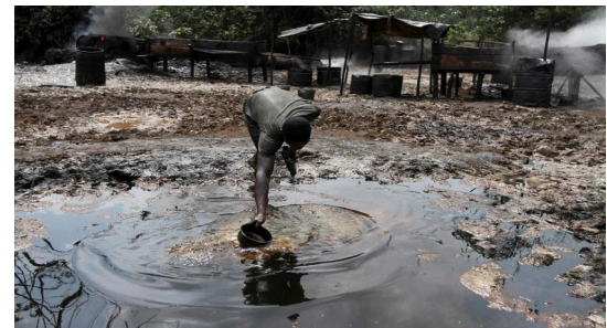
Plate 3: Bayelsa villagers lose livelihoods to oil spill in the Niger Delta