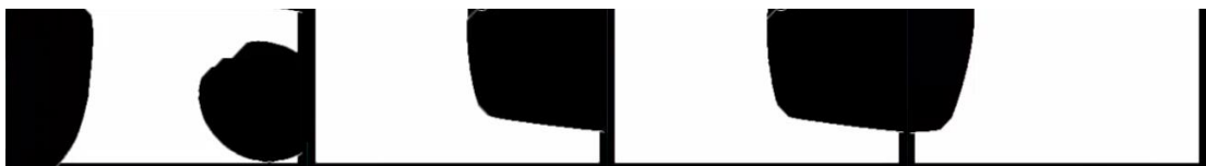
Figure 2: Grabbing the product from the image (Torkul et al., 2017)

After Relu activation in the first layer, outputs are classified with an A* heuristic, which grabs the image of the product from a background as seen in Figure 2. Background pixels are set to 0 to eliminate before passing data to the second layer. Pooling layers provide cleaning gloves and shadows at the edge points, and 2D convolution layers are expected to learn color and shape of the product. A dense layer having 1024 nodes is set with 25% dropout ratio to prevent the network from overfitting. Because small images are used, high dropout ratio is set for the layer. Finally, a logit layer is added to the model to detect 17 products.