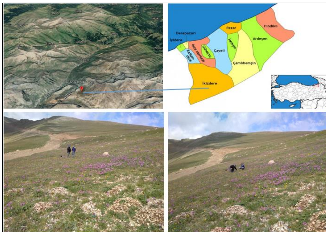
Figure 1: Location of the Study Area and Some Photos

The long years average temperature of the research area is 14.5°C and the precipitation amount is 2301.5 mm (Anonim, 2021).