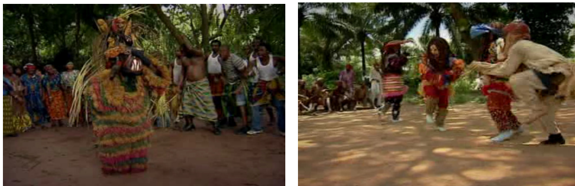
Fig. 1: Masquerades displaying during Ikeji festival in Arondizuagu (one of the notable festivals in Imo state, Nigeria)