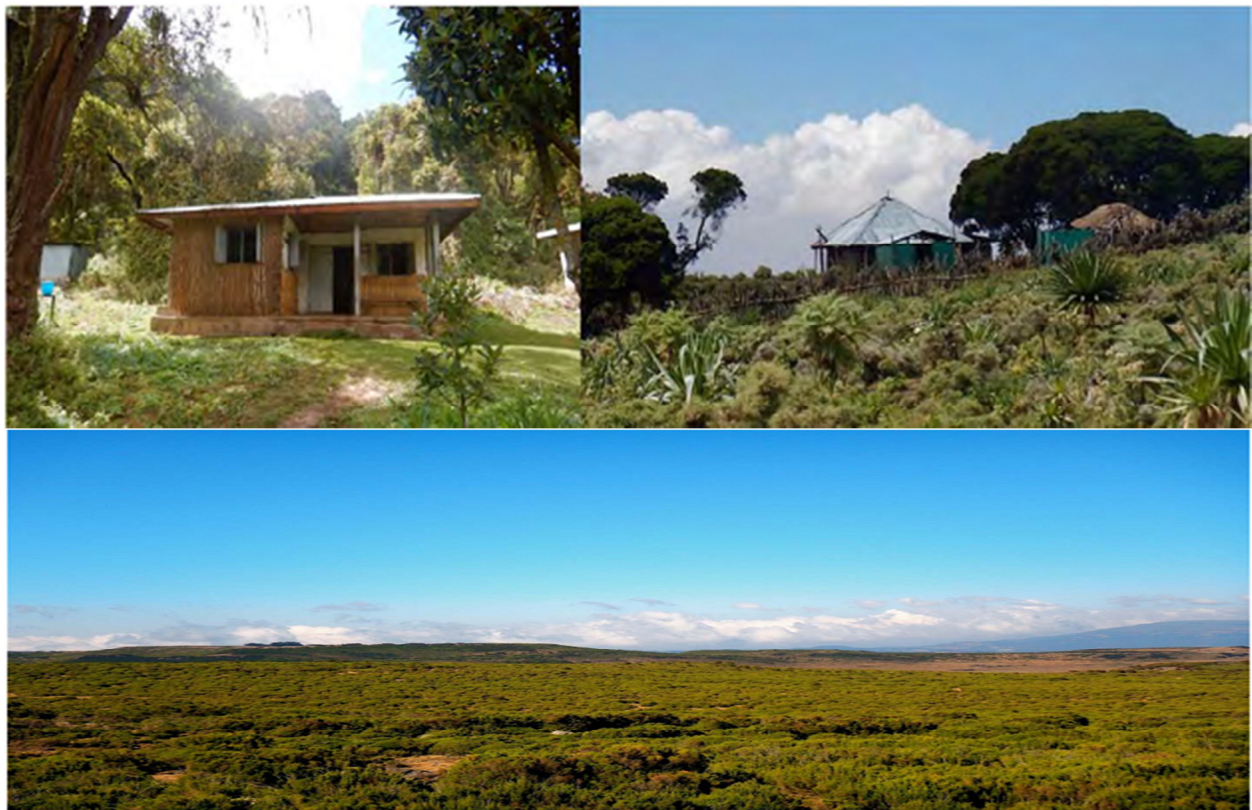
Fig 2. Ecotourism opportunities in Adaba-Dodola community based ecotourism site, in Ethiopia (Wilder, 2016).

Local peoples' enthusiasm for ecotourism, economic and infrastructural development, proximity to other ecotourism destinations, increasing number of educated human labor and presence of ecotourism support policies were also the opportunities to promote the ecotourism benefit in the districts. The presence of these opportunities in both districts is important in that they enable to promote resource conservation, improve tourism facilities, and contribute to enhance the ecotourism benefit in the livelihood of local communities (Menbere and Menbere, 2017). Similarly, the existence of these opportunities favors the importance of community based ecotourism on local livelihood (Ogato et al., 2014; Kidane-Mariam, 2015; Taressa, 2015a). The enthusiasm and participation of communities in ecotourism is vital to improve their living conditions and at the same time enhance conservation through ecotourism (Honey, 2002).