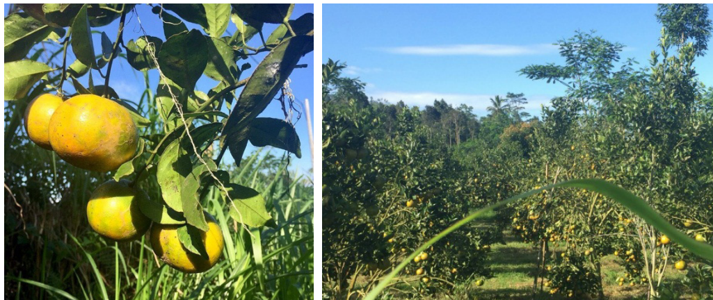
Figure 8. Citrus plantation at Dusun Untalan

To promote all potential tourist destinations in Jungutan Village, Head of Jungutan Village has established a tourism awareness group, locally known as Kelompok Sadar Wisata (Pokdarwis) consisting of youngster community who are interested in tourism activities at Jungutan Village. Currently, this group has run guiding tours for trekking to Mount Agung via Jungutan. Promoting ecotourism would give benefit to the community, generate income for the local people and increase awareness of locals on the importance of maintaining their environment to attract visitors from around the world (Fahrian et al. , 2015; Islam et al. , 2011).