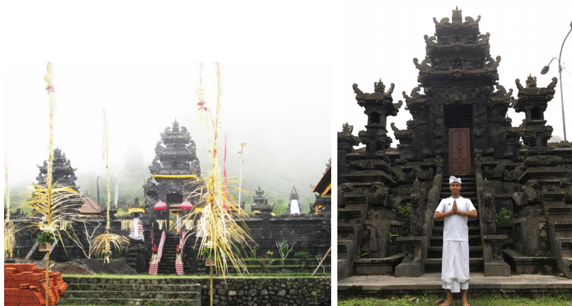
Figure 1. Pura Pasar Agung Sibetan (source: http://jungutan.blogspot.co.id/p/pasar-agung-temple.html ) and personal document.

Jungutan Village has three main temples, i.e. Pura Pasar Agung Sibetan, Telaga Tista dan Pura Bangkak. Pura Pasar Agung Sibetan located at Dusun Yeh Kori, at 1.000 m above sea level. This temple was built using local lava stone with Balinese stone carving, and has beautiful scenery with Mount Agung as the background. Pura Pasar Agung Sibetan (Figure 1) has a cool weather, between 10°C in the morning to 20°C during midday. It is easily accessible with asphalt road. Parking areas available for small cars, and there is a parking lot available for big cars and busses 500 m away before reaching the Temple. Pura Pasar Agung Sibetan also popular among visitors who prefer trekking activity to Mount Agung. Visitors usually camp around the areas a day before trekking, or pray at this temple before continue trekking.