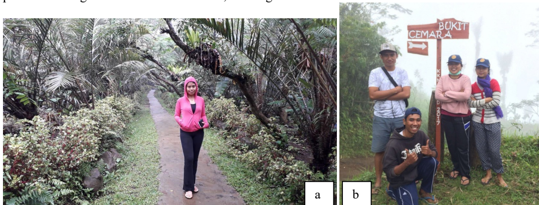
Figure 4. a) Entrance to Bukit Surga with salak plantation on each side, b) Entrance to Bukit Cemara

pine trees along the road to Bukit Cemara, which give the name of the hill.