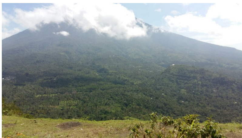
Figure 6. View from Bukit Cemara