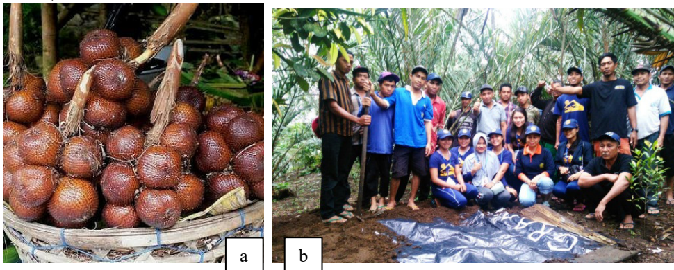
Figure 7. a) Salak Fruit, b) Salak Gula Pasir plantation

Besides nature based tourism, Jungutan Village also offers agrotourism potency. As Jungutan located at the slope of Mount Agung with fertile volcanic soils, it gives advantage that varieties of local fruits grow well in this region. In particular, local people grows salak bali ( Sallaca edulis ), known as snake fruit (Figure 7), which is endemic in Karangasem Regency. In 2014, salak production in Bali was 69.271 ton, from 8.3 million trees, majority produced from Karangasem (Deperindag Provinsi Bali, 2015). Salak plants grow best on 600 – 700 m above sea level, and favor volcanic soil.