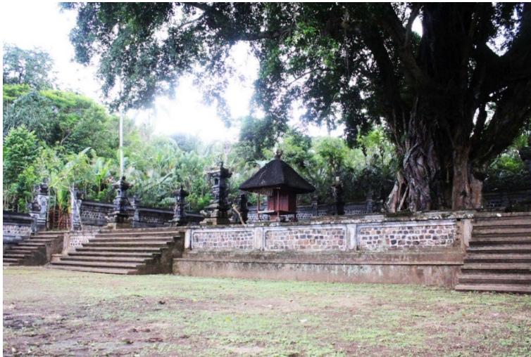
Figure 3. Pura Bangkak

Pura Bangkak (Figure 3) is located at Dusun Jungutan. It is symbolized Pura Batu Madeg located at the north of Besakih Temple, the biggest temple in Bali. Ngusaba or celebration at Pura Bangkak was conducted every 20 years, based on legend, where Karangasem King was meditated at Pura Bangkak to be able to have a child and promise to give a big celebration for the Temple if he got a child. After having a child, The King was forgotten about his spell, causing bad luck and he has to give a big celebration every 20 years which include Buffalo in the offering.