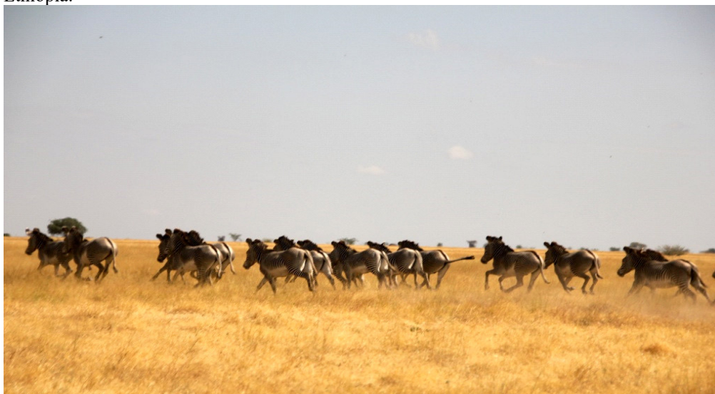
Figure 3: Grevy's Zebra

The national park is primarily known for its population of Grevy's zebra (Figure 3) that thrived on the extensive perennial grass lands (Fanuel, 2012). Information obtained from the national park office indicated that More than 32 large mammal species are recorded in the park excluding bats and rats. Large mammal species include Beisa Oryx, Soemmering's Gazelle, gerenuk, lion, leopard, cheetah, black-backed Jackal, Bat-eared fox, common Jackal, spotted hyena, aardvark, tree climbers and others. According to Fanuel Kebede (2012), the Hallaideghe grass land plain harbors the largest populations of Grevy's zebra, Soemmering's Gazelle and Beisa Oryx in Ethiopia.