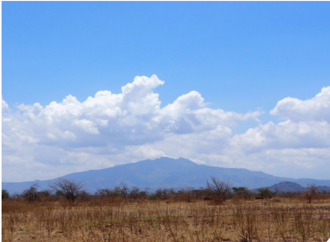
Figure 2: partial view of Hallaideghe plain with the background Mount Asebot