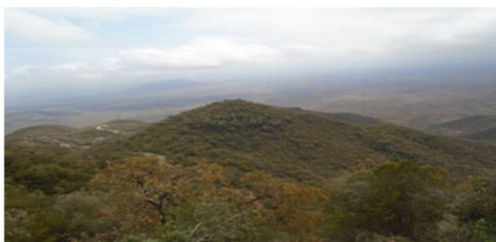
Picture 6: Churches and topography with forests at Mt. Asebot