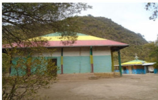
Aba Samuel nuns' church