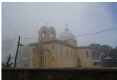
Kidist Selassie monks' church