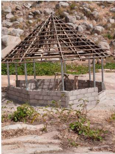
A Canopy under-construction on top of the Mountain