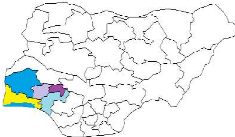
Figure 1b: Map of Nigeria showing States in South-West