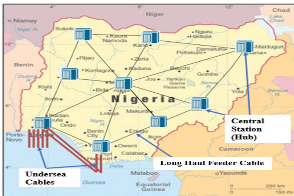
FIGURE 5. 1 Proposed Architecture for Interconnected Backbone