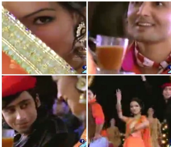
Tarang Image C

All these three images have been taken from a famous milk brand which named as Tarang. All three images entirely against our true cultural values in connection to dresses, colour, setting and expression/gesture of the actresses and actors. The very first thing which we can see in all three images is women are being represented as a dancing girls .In all pictures they are dancing with a boy which is against our culture because in our culture women are not allowed to dance or dance with a boy. Through image A and B a lavish and luxurious style of living is being represented and this thing can create a bad impact in the minds of the viewers because majority of Pakistani cannot afford such way of living. In image A the dress code of the women is not according to the culture she is not wearing dopta and her hair are also free and the way she is looking at the boy showing her sensational and romantic nature. So her gestures are not according to cultural values. Behind the main characters there are some others people as well who are also dancing along with these main characters.