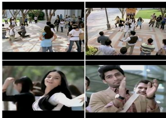
Sunslík Image C

The images A,B and C have been selected from a famous Pakistani brand Sunslík(Shampo) and in all these images there is total misrepresentation of Pakistani cultural values through the dresses, colour, setting and expression/gesture of the actresses and actors. First off all, we can see that in Image A and C female models/actresses wearing jeans and shirts which is entirely against our cultural values and tradition. In B image girl is wearing black long kameez but with a capri (a kind of a short trouser). And in A image girl is also wearing a blue gown with a thin fabric and displaying her legs. The setting of the image A is an airport and a dance stage and setting of scene of the image B and C are outside with an open area along the road side. In image A girl wears dark colour like blue, green or maroon which is displaying her exuberant nature. She wants to do dance, it's her passion which is totally against a Pakistani culture and she is also going to another country for her audition in a dancing competition as we can see she is at an airport, wearing short green shirt and tight jeans with high heels which shows her inner exuberant nature. After that in next scene she is dancing in front of other girls wearing short shirt and short trouser with open hair showing her care-free nature and in the last picture she wears a blue gown with transparent fabric and dancing in front of many people on a stage and displaying her legs and arms with open hair.