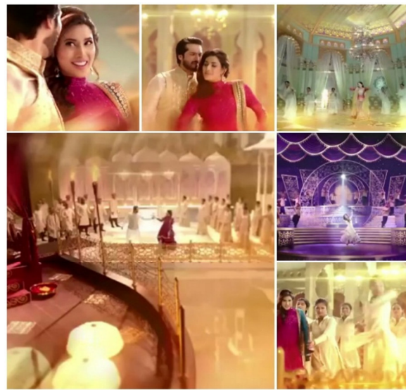
Tarang Image B