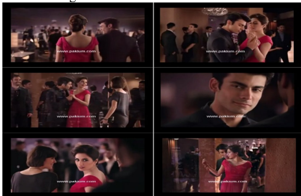
Lux Image C

All three images have been taken from a famous brand named Lux (Soap). All these three images showing cultural diversity through the dresses, colour, setting and expression/gesture of the actresses and actors. In all these images models wear sleeveless silk gown and displaying her body fully. In image A setting of the scene is in bathtub in a washroom and after that the hero is sitting in a huge well decorated room on a moving chair holding a book. In image B we can also see bathtub and a woman putting soap on her body after that she is coming from a long stairs in front of audience with a huge smile and lights are used to prominent her body. In image C actor and actress is in a party with a lot of people, holding each other's hands with sensational expression, which can show their inner exuberance feelings.