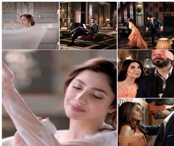
Lux Image A