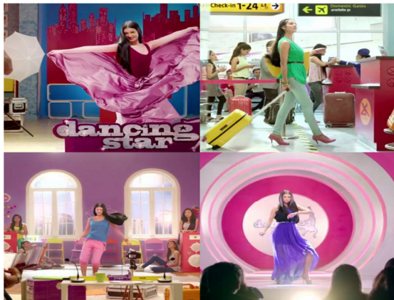
Sunslík Image A