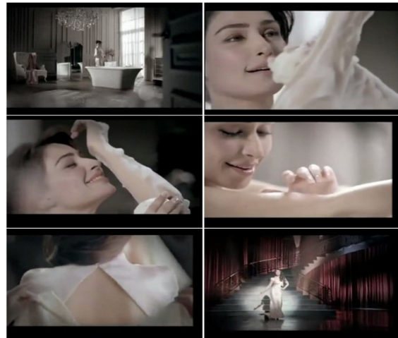
Lux Image B