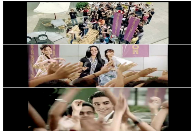
Sunslík Image B