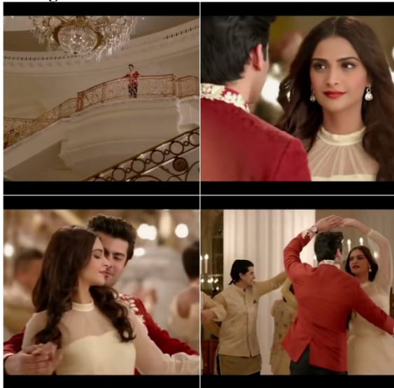
Tarang Image A