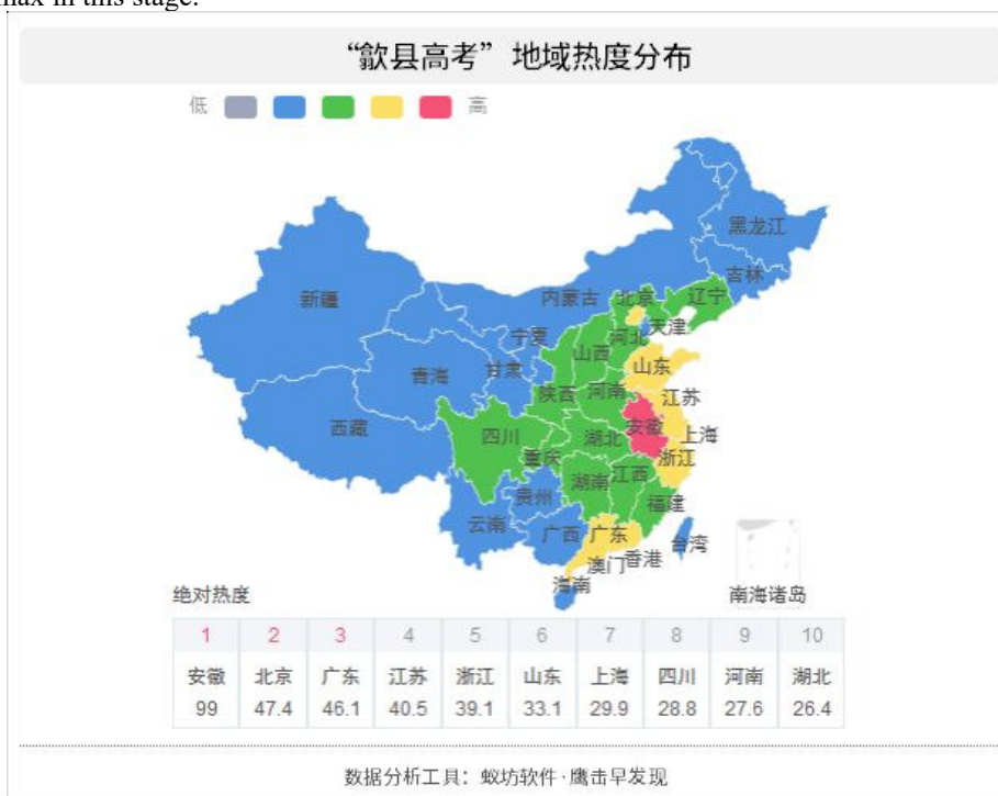
Figure 2. Regional Heat Distribution on July 7

The college entrance examination in Shexian County is a postponement in the process of postponement. The sudden and unprecedented particularity of this event has brought it heat and concern. Through the analysis of the public opinion monitoring system, it can be seen that on the first day of the college entrance examination on the 7th, the absolute heat of Anhui reached 99, ranking first in the country and far exceeding Beijing and Guangdong, the second and third places; It can be seen that the netizens in Shexian County, where the public opinion took place, paid close attention to this matter. The postponement of the college entrance examination was closely related to the interests of local examinees. The popularity of the college entrance examination in Shexian County reached a climax in this stage.