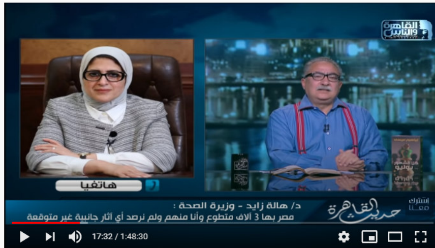
#القاهرة_والناس #حديث_القاهرة حديث القاهرة | مع إبراهيم عيسى الحلقة الكاملة 11 ديسمبر 2020

This program is presented by “ Ibrahim Issa” . the key messages used in this episode was strong and full of statements that supports certain point of view