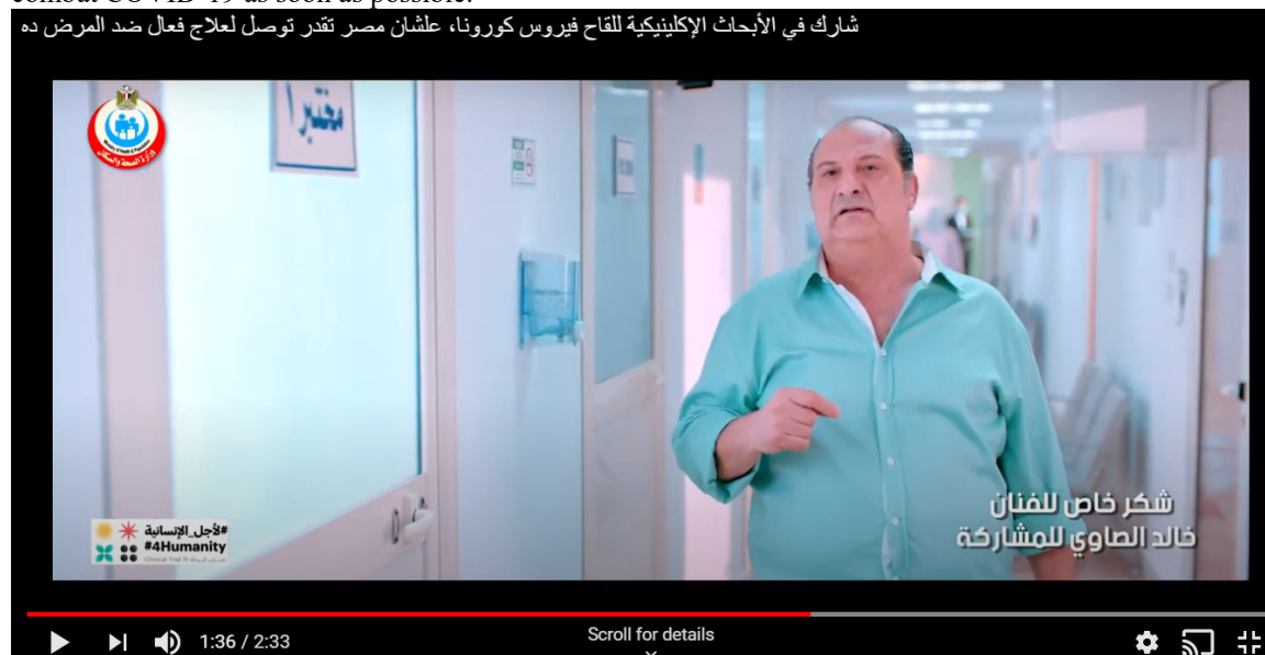
حملة لتشجيع المصريين للمشاركة في الأبحاث الإكلينيكية للقاح فيروس كورونا 1

In Egypt , some campaigns used celebrities to influence people to help in taking the vaccine in order to combat COVID-19 as soon as possible.