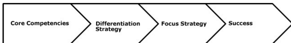
Fig 3: Linking Core Competencies, differentiation, focus strategy with success

In line with the arguments of Wright (1987) and Porter (1985), the best strategy is for political parties with lower access to resources to pursue a differentiated focus strategy to enable it achieve a sustainable competitive advantage. Such parties should promote its core programmes through the exploitation of its core competencies as shown on Fig. 3 (Prahalad and Hamel, 1990).