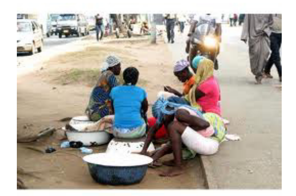
Figure2: Kayayei resting on the street

The third group was in a category of women with mixture of marriage status. It covered married, unmarried, avoiding forced marriage, divorced, and "getting-ready-for-marriage" women in an age range of 21 to 30 years. They owned most of the children in the first group. Women in this group lived decent life relatively in their rented kiosks. The last group made of women at 31 and above years. These women were the circular migrants and played pioneering role in the kayayo business. They are established and functioned as recruiters of kayayo women. Some are also mothers and nannies of kayayei and their children. Mothers of kayayei who were nannies are also identified as secondary kayayei like the children. This group has the smallest number of people but the