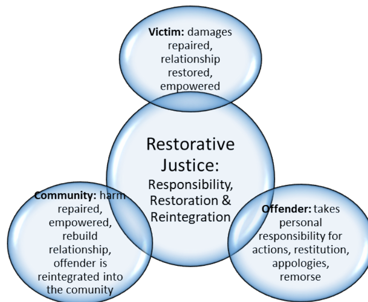
Figure 2. Core Elements of Restorative Justice. Adapted from Miers, et al., (2001); Maglione, (2020).

The philosophical elements of Restorative Justice are interconnected in a circle of justice and can be summarized in three R 's: Responsibility, Restoration and Reintegration (Miers et al. 2001). It provides for offenders' accountability by encouraging offenders such as terrorists to take personal responsibility for acts of killings, arson, demolition of properties, rape, hostage taking and kidnappings. Restorative justice addresses the root causes of terrorism such as religious extremism, bad government, socio-economic marginalization, poverty, unemployment, economic marginalization, power struggle, lack of education, advancement in technology (Crelinstein, 2014; Rapoport, 1984; Omede, 2011; Crenshaw, 1981). It embraces mediation, peace keeping, cooperation, reconciliation, repairing harm and rebuilding relationships rather than coercion and retribution. As provided above, it empowers victims and affected community through the process of justice and show equivalent concern for their needs. All stakeholders including family members of terrorists' victims, bereaved family members and all others affected by terrorism attacks have equal opportunity to dialogue with victims, offenders and mediators. It is expected that the outcome will repair wrongs and reintegrate offenders (terrorists).