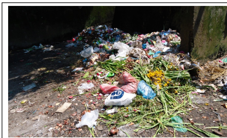
Figure 2.The waste on the roads in Sylhet city Corporation

In the table 4, it shows the opinion of the respondent about the environmental problems of solid waste mismanagement. They gave their opinion, 86 percent says that, air is polluting by solid waste mismanagement and 14 percent support to water pollution. Throwing waste in streets and drains instead of dustbin, there create odor. As a result, air becomes polluted. On the other side, solid waste mixed with water of river and water becomes polluted. Moreover, in toxic chemical waste is also spreading rapidly into canals and rivers.