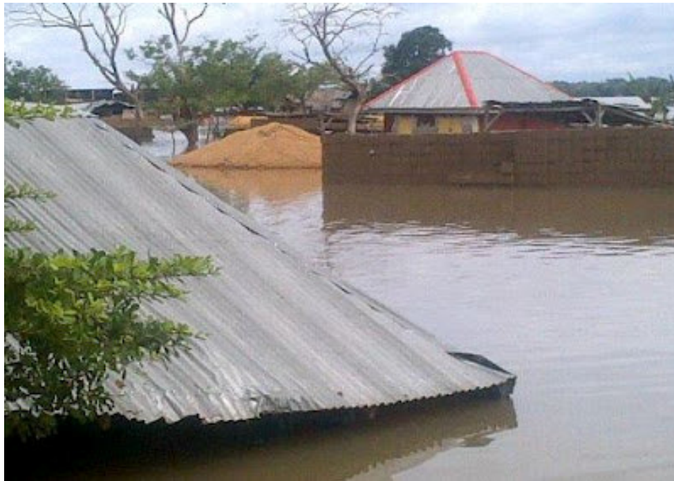
Figure 1: The Devastating Effects of Flooding on People's Houses in Rivers State.