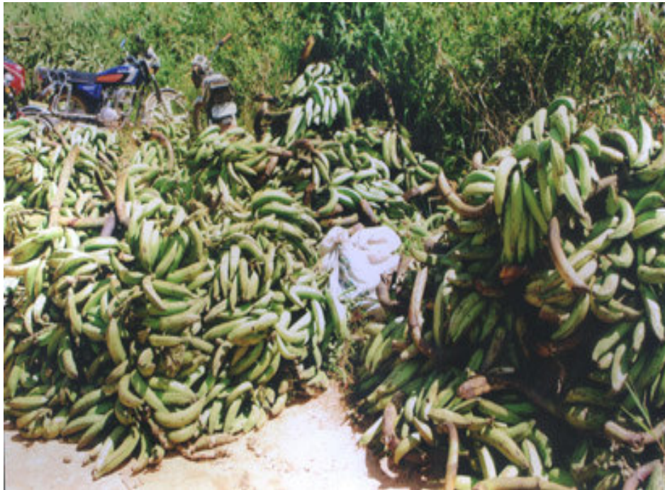
Figure 3: The Devastating Effects of Flooding on People's Farm Produce in Rivers State.