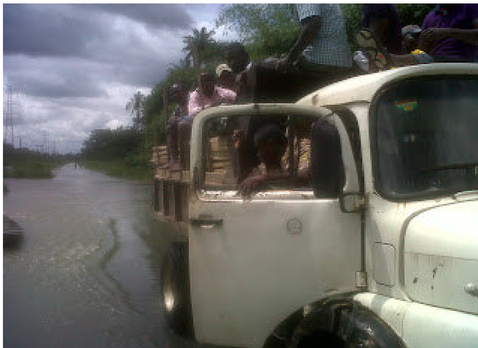
Figure 2: The Devastating Effects of Flooding on People's Access Road in Rivers State.