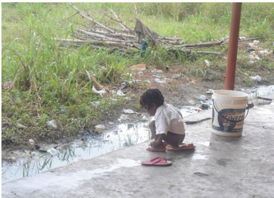
Figure 4: The Devastating Effects of Flooding on People's Lifestyle (see an incident of a child defecating at a residence) in Rivers State, which may lead to contamination of diseases.