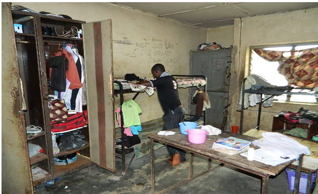
Figure 3: One of the room in the studied hostels with wardrobe, bunks and table

Wardrobes were considered to be adequate by most of the students interviewed. Nearly all rooms surveyed have wardrobes big enough to contain their clothes. Others who disagreed to its inadequacy may be due to the fact that the one in their rooms were in a state of disrepair. As evident in table 5.1, majority (68.3%) of the student asserted non availability of kitchenette in their hostels. This was corroborated by the responses of 80.2% of students confirming its inadequacy. Equally, cafeterias were not sufficiently provided in most of the hostels with reference to table 5.1, as a result a small number of the students agreed to its adequacy, possibly because of proximity of cafeterias to their hostels. In spite of this, majority (78.2%) authenticated its inadequacy. With regard to common/TV room 54/101 (53.5%) of the students validated its adequacy, while 47/101 (46.5%) disagreed, undoubtedly because of poor maintenance of the room and the facilities in it. Responses of most of the students affirmed inadequacy of cyber café, notwithstanding other students admitted that it is adequate, most likely because of its availability in their hostels or closeness of their hostels to location of cyber café.