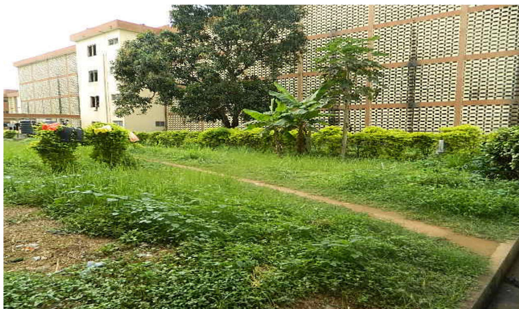
Figure 2: One of the hostels lacking recreation facilities