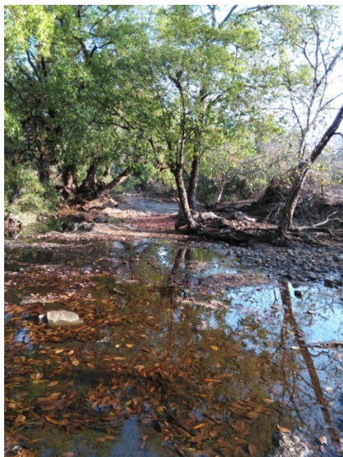
Fig.4.1 Stream in November declining