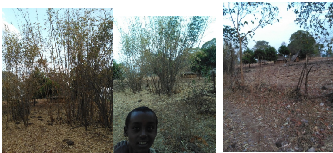
Fig4.3 Attempts to replace vanished Bamboo forest in kola area of Metkel zone

To consolidate this culture of afforestation, government support is needed because the seedlings were threatened by insects and mites. In 'dega' parts of the region, reforestations culture was widely prevailed than kola areas. Although indigenous forests were destroyed, the communities were replacing manmade forest. For 'dega' residents there was also better opportunity for practicing small scale irrigation than 'kola' areas though the exiting physical feature became hindrance for fully exploitation of water resource. They also made their culture to tracing to conserve their land and environment. Changing of crop type was also other way they used to adapt climate variability. Before 25 years for example 'mera', 'teff', 'appo' were common crop types but now a day these items were disappearing and becoming forgotten in money kebles. Instead new crop types like cocoa, seasm, Negro seed, and mango are commonly produced. Traditionally people able to found hen and cattle waste as best solution to destroy the extraordinary weeding that appeared following climate variability and less land productivity.