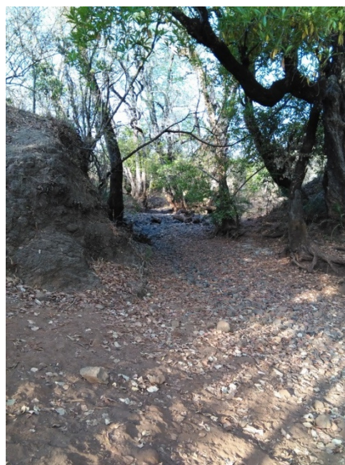
Fig4.2 Stream in February dried

“When we compare the situation today with the past, the climate has changed. This area was very productive in the past. Climate change has affected our areas, community and family for the last sixty nine years. Today people have left the area to find work elsewhere because we have not been able to save any of our food for the bad times because we never have any extra food” the 65 years old responded.