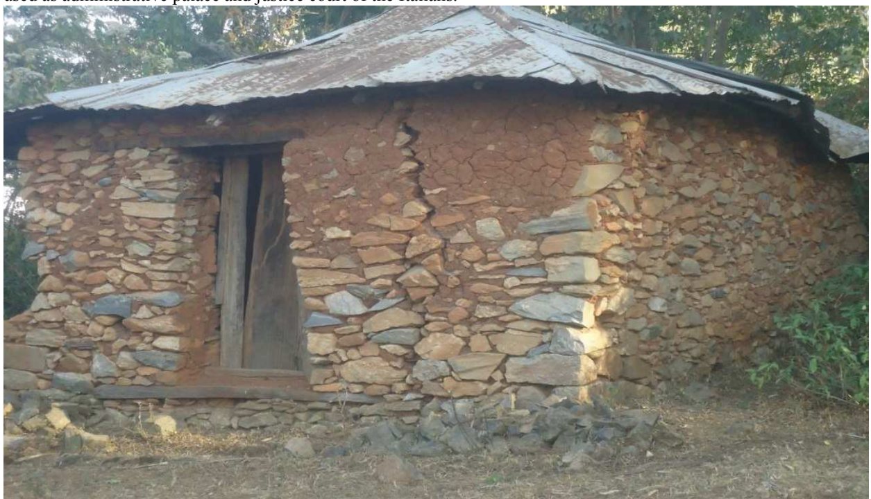
Figure 2. Fitawrari Duguma's tomb. Photo taken by the author, February, 9, 2013.

Fitawrari Duguma Jaldeso Palace, constructed in 1930 E.C/1938 G.C, served as Italian administration center during that time. This house has two parts (underground part and above ground part). The underground part of the house had served to jail those individuals committed crimes. Whereas, the upper part of the house was used as administrative palace and justice court of the Italians.