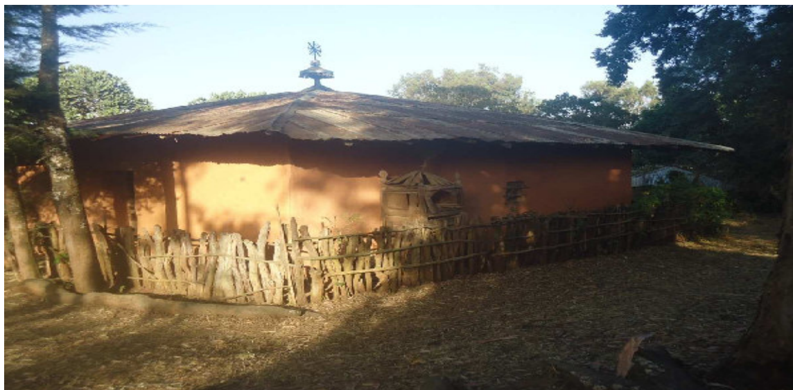
Picture 3. St. Sillase Orthodox Church constructed by Fitawrāri Duguma in 1930 E.C. February 9, 2013