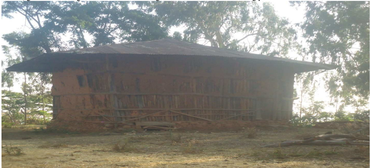
Figure 1. Fitawrari Duguma Jaldesso's Palace, constructed in 1930 E.C/1938. Photo taken by the author, February, 9, 2013.

constructed: his palace, fortification, church and his future grave around his administration site. His palace is registered as the third important palace in Wollega zone next to Dajjach Kumsa's palace of Leka Nekemte and Ras Mokonnen Damiso's of Arjo awrājā during this study conducted. Nowadays Duguma's palace, fortification, church, grave are still significant historical heritage of Limmu. See the following picture.