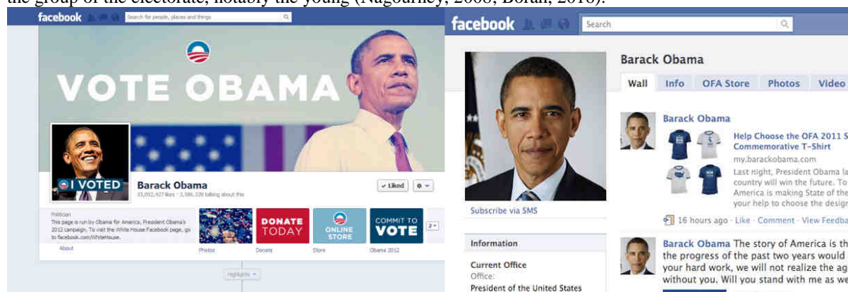
Fig. 2. Obama 2008 Facebook campaign page (Smith, 2015).

It was disclosed that through social networking sites political candidates appeal to citizens by keeping regular contact with their supporters thereby inducing supporters’ contribution and likeness through active comments (Okoro & Nwafor 2013). This supports studies, which emphasised that most political parties and leaders maintained an account on Facebook, Twitter and other social network sites, where they place their agenda (David et al., 2016; Kreiss 2014). Indeed, the use of web-based social networking systems, for instance, Facebook, Twitter and YouTube in the electioneering campaign can never be overemphasized (Ajayi & Adesote, 2015). For example, social media such as Facebook allow users to partake in their political beliefs, support a specific candidate and interact with others on political issues (Chinedu-Okeke & Obi, 2016; Okoro & Nwafor, 2013; Abbott, MacDonald, & Givens 2013; Boulianne, 2015). Specifically, evidence has indicated that a notable use of Facebook was during Obama's 2008 political campaigns (see Fig 2). This was efficiently used to contact the group of the electorate, notably the young (Nagourney, 2008; Borah, 2016).