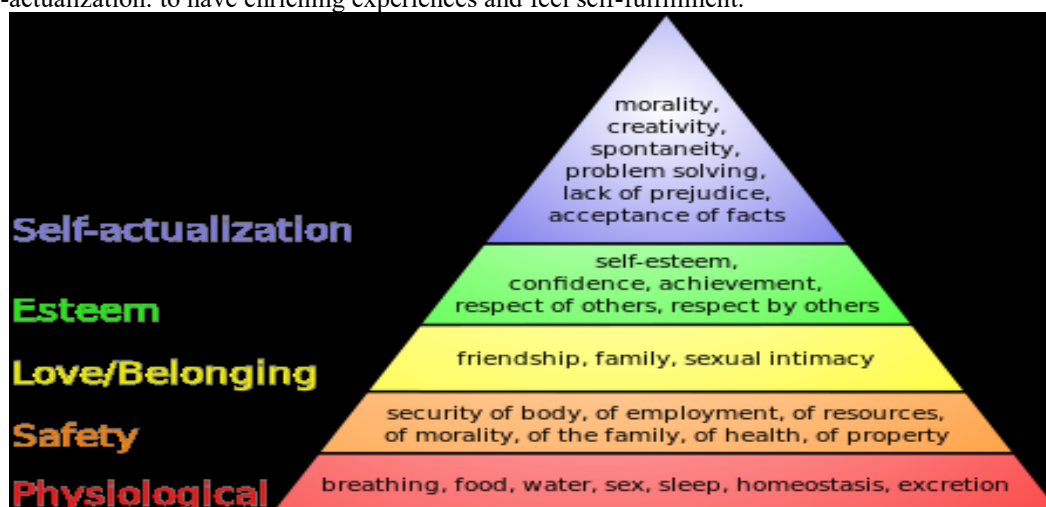
Figure 2.1 Abraham Maslow Theory of Needs; Source: Tanja (2015).