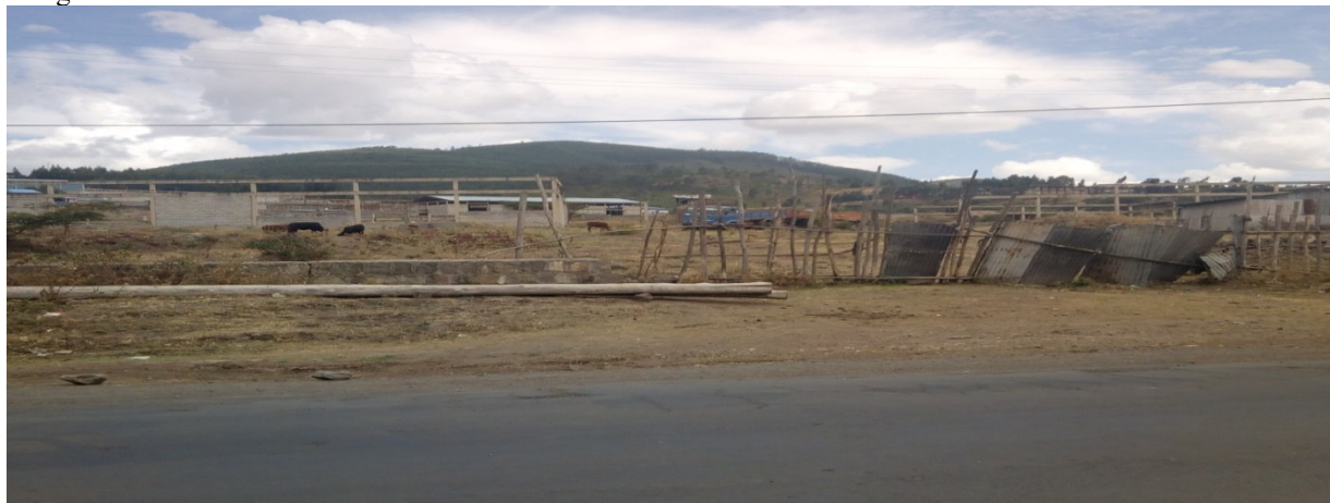
Figure 9: Land taken for investment and simply fenced for eight years without expected purpose (Source: Photo taken during field observation on May, 13, 2019).

The following photo was taken during field observation by the researcher to identify investment related challenges in the town administration. It shows that although some investors have implemented their projects and the local communities are started to benefit from those investments in a direct or indirect ways, but numbers of projects like shown in photo below started in 2011, it is about eight years old has laid to failed to use the allotted land in spite of the fact that the developers are obliged to operate and make the local people, themselves and government beneficiaries.