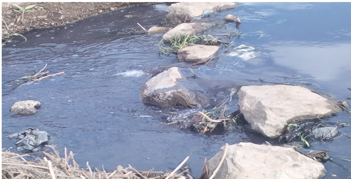
Figure 8: Liquid wastes discharging to the river (Source: Photo taken during field observation on May, 2019).

One of the participant of the focus group discussion said that, “we sometimes use the polluted water for irrigation, we have no another option but it will affect our health, i.e. resulted in itching of our leg and feeling of discomfort on our health. We will farm it when the rain is coming at least it decreases its pollution effect”. According to data obtained from interview with town’s Environmental Protection and Greeneries office, some investment projects became environmental challenges. For instance; Haffede Tannery Industry has been built on the side of the river and Finfinne (Addis Ababa) to Jimma main road. It discharges liquid wastes to the river without proper treatment. Due to this, decision to close taken over it in 2017. However, sister company (garment) inside it still on working.