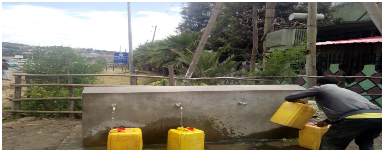
Figure 6: Water provided by Best Plastic Factory for public (Source: Picture taken by the researcher during field observation on May, 2019).