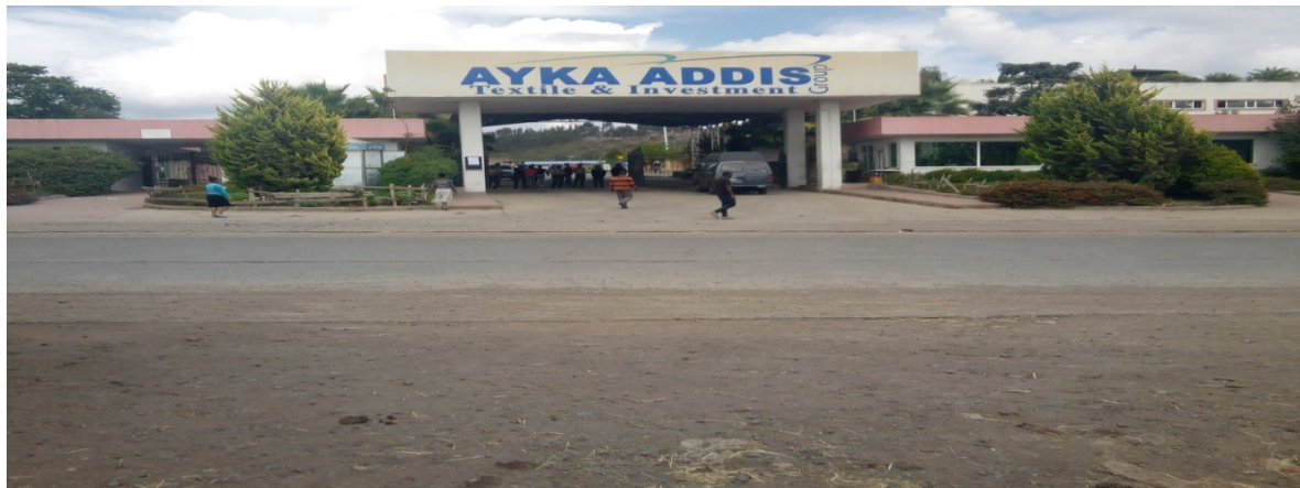
Figure 4: Partial photo of Ayka Addis textile and Investment (May, 07, 2019).