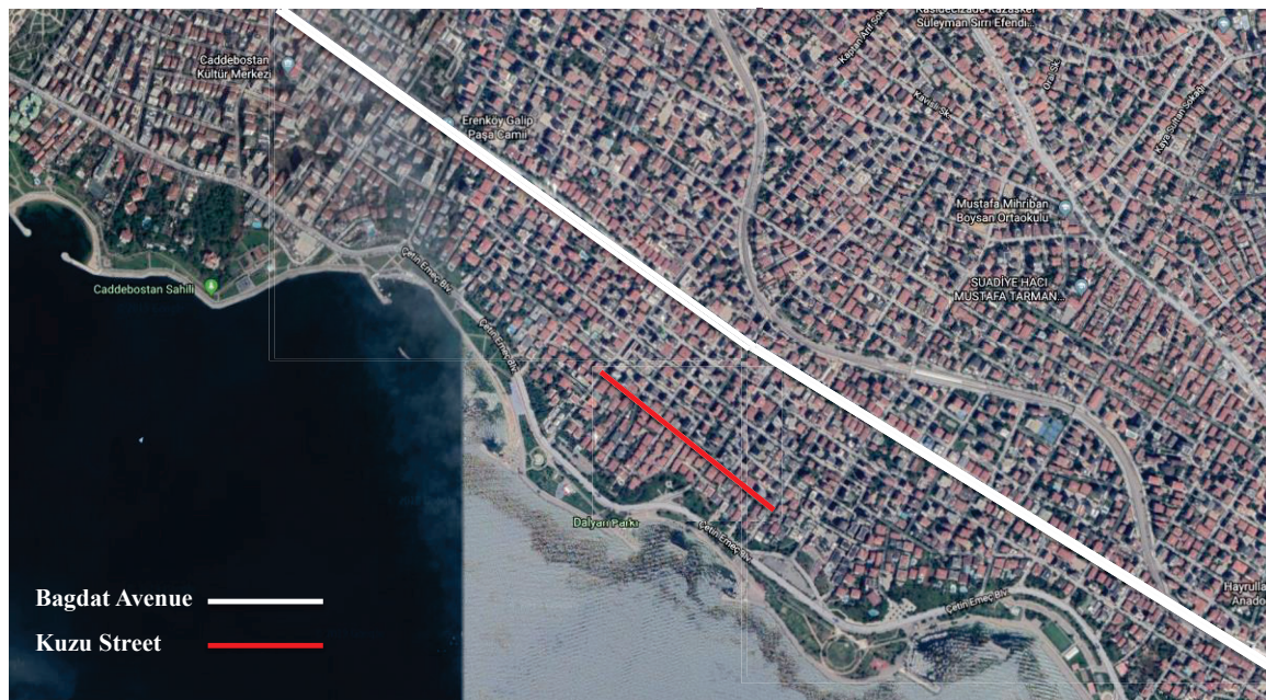
Figure 2. Bagdat Avenue-Kuzu Street

An attractive quality of the Saskinbakkal district is the neighborhood's desirable location between the coastline and Bagdat Avenue, m 2 unit price of the houses is around USD 1800, making it one of the districts of Istanbul with the highest property values. This area is undergoing an intense transformation phase as a consequence of a collusive agreement between local government, contractors, and stakeholders, although the disaster risk of the neighborhood is rather low. The motivation underlying the ongoing rapid transformation phase of this area that has started with the claim that the area entails a disaster risk even though the risk is rather low is the fact that all stakeholders achieve an economic benefit from this process (Berkmen & Turgut, 2019). The number of buildings demolished and rebuilt in Saskinbakkal in the last decade is more than the number of buildings that survived. Most of the residents in the area apply to contractors asking for the renewal of their old buildings that are not potentially earthquake-prone, tempted by the economic advantages they will gain.