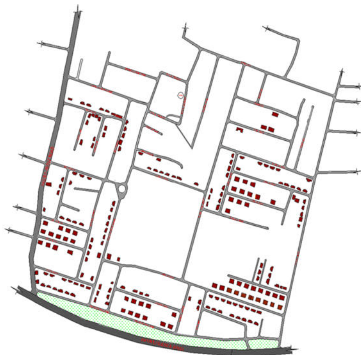
Figure 1: Federal Low Cost Housing Estate, Akure

The Research population for this study were the head of households in the federal low cost housing, estate. The buildings on the estate were derived using digitized Google Earth Imagery of the area. The result of this exercise, showed that there are 194 buildings, low cost housing unit which is the target population for the research (see Figure 1). The sampling size for this study is the total buildings in the study area. In essence, 194 Questionnaires were administered to the buildings in the area. The study employed the cluster sampling method where all the buildings were used for the study. This study targeted the household heads, in cases where the household head is not available, an adult who has the knowledge about the household water and sanitation systems was selected as a respondent. The coding and processing of data collected for this research was analysed using the IBM statistical packages for social scientists (SPSS) version 22, the Arc Map GIS version 10.4 and Microsoft Excel 2013.