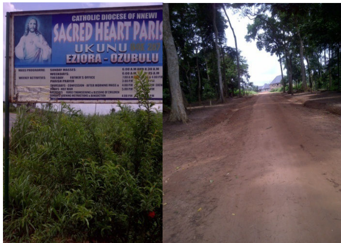
Fig.1a & b