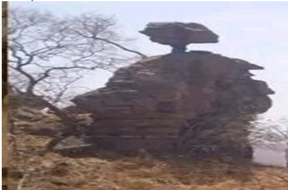
Picture: Degot mariyam kato stone

Degot Mariyam Kato Stone is located approximately 28 km away from shindig town and is found in Gomer Dond Kebele with the special name of Deki Mabil Sub Kebele. This stone is carved out of the top of a high mountain in a magnificent shape.