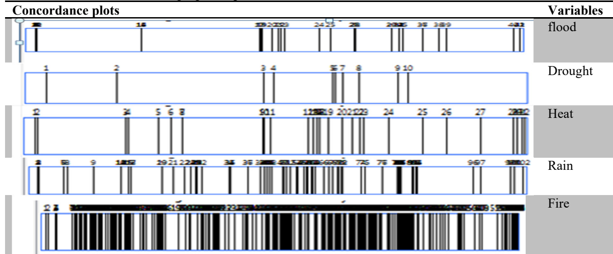
Figure 2: Concordance Plots of some climate change registers in the King James Bible

Since the intentions of running a frequency test on these linguistic variables was to find out their recurrence in the corpus in order to have an idea of how often readers could come across the specific texts, it was equally necessary to run a concordance plot test on the King James version of the Bible to see how these variables are distributed across. The following figure captures a concordance test on the five words tested.