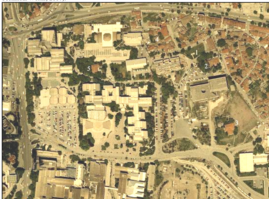
Figure 7. The Satellite Image of Hacettepe University City Campus, Traditional Pattern and Immovable Cultural Properties (In the map: 1 The house of Mehmet Akif Ersoy; 2 Tacettin Mosque; 3 Karacabey Mosque; 4 Hacı Musa Mosque; 5 Hacı İlyas Mosque) (Hacettepe University, The Archives of Directorate of Construction and Technical Works, 2007)

Various institutions have ownerships on the campus area in different ratios because those institutions owned some properties in the Hacettepe district before the transformation of the region. The total area of the campus is 228,250 (m 2 ) as mentioned before (Hacettepe University, The Archives of Directorate of Construction and Technical Works, 2007). Due to those ownerships, the biggest proportion of the campus area belongs to Hacettepe University with the scale of 208, 596 (m 2 ) which equals to more than 91.38 % of the total area (Hacettepe University, The Archives of Directorate of Construction and Technical Works, 2007). The other ownerships are shared by Altındağ Municipality with a 11,654 (m 2 ) (which equals to about 5.1%), The General Directorate of Foundations with a 7,447 (m 2 ) (which equals to about 3.2%), and Ministry of Finance with a 553 (m 2 ) (which equals to about 0.24%) (Hacettepe University, The Archives of Directorate of Construction and Technical Works, 2007).