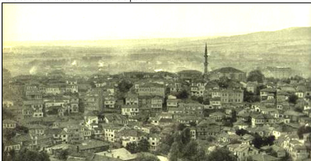
Figure 1. View from the Ankara Citadel to Hacıbayram District, the Traditional Ankara Houses, in 1950's (Kinross & Mantran, 1959)

Ulus had important historical characteristics and many historical buildings which belong to Roman, Byzantine, and Ottoman periods. Ankara Citadel , which was determined as a national symbol in Jansen Plan, was fortified by the Galatians, strengthened by Romans, rebuilt by the Byzantines, and maintained by the Seljuks and Ottomans (Fodor's, 1997). The city's oldest mosque, Alaaddin Mosque , was built in 1178 within the citadel (Fodor's, 1997). The Temple of Augustus which was built in 2 nd century B.C. as a shrine to Cybele, a nature goddess of Asia Minor, is located behind the Hacı Bayram Mosque (Fodor's, 1997). In addition, The Column of Julian and the Roman Bath , which is situated on Çankırı Avenue in Ulus, have been also representing the historical and cultural characteristics of the old part of Ankara.