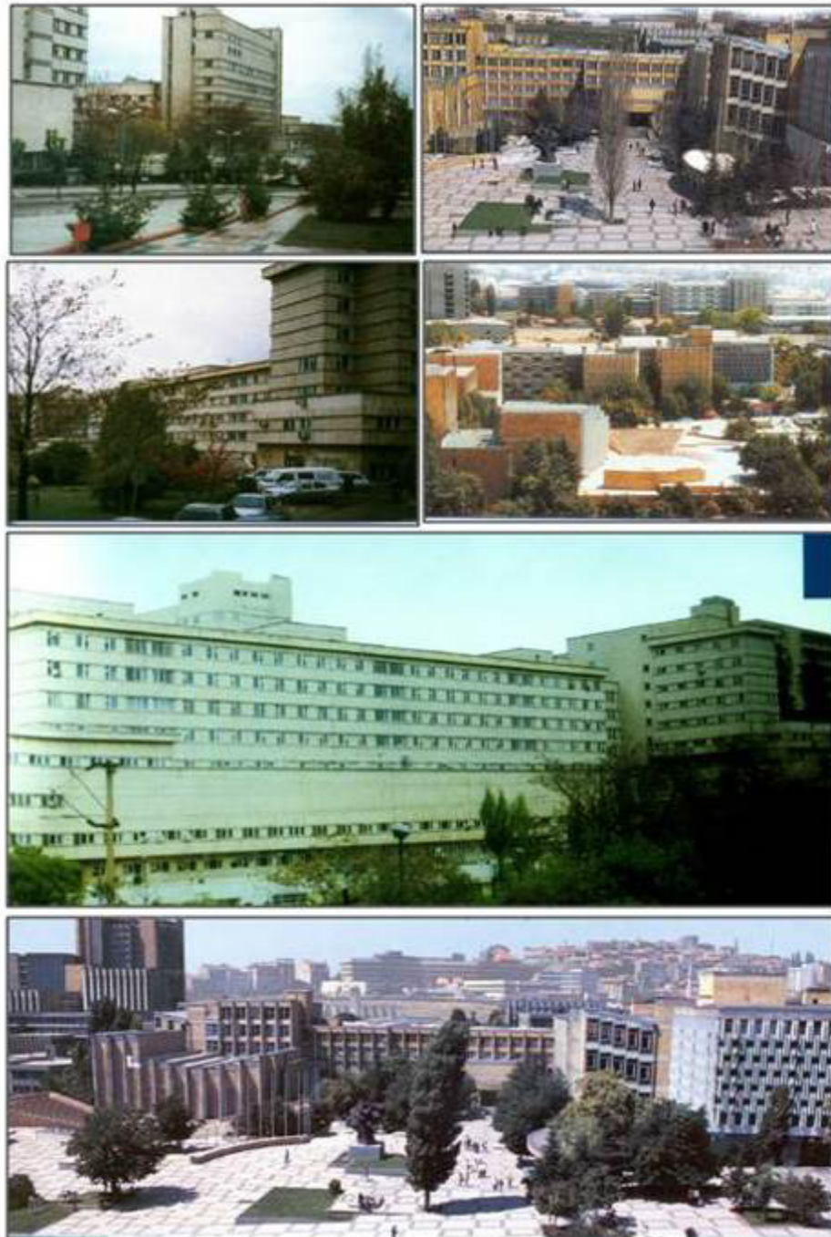
Figure 6. Old Photos from Hacettepe University City Campus

Hacettepe University City Campus did not have a macro plan and a program in the beginning before the construction. After the accomplishment of the campus area, building scheme and development plan were prepared. During the construction process of the campus area, the suitable place for the first building was determined due to the easiest and fastest expropriation site in the region. Hacettepe region experienced the modern planning approach in different conditions due to its historical and cultural structures. Among the others, modern planning indicates two basic and important concepts which are defined as holistic and comprehensiveness. Modern planning needs a rational and comprehensive planning approach. However, conditions of the period did not allow to plan in a holistic and comprehensive way, and limited the application of a rational and reliable strategy because of the historical texture of the area which made things difficult in terms of expropriation. On the other hand, Hacettepe University with its medical units were used as legitimate force of modern planning which was also assumed as public interest . Hacettepe was an ideal model to realize and