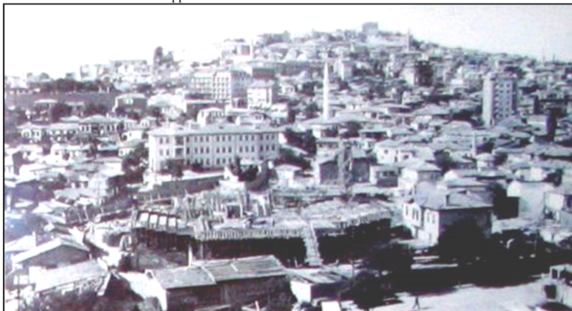
Figure 5. The First Construction on Hacettepe District, in 1954 (Hacettepe University, The Archives of Directorate of Construction and Technical Works, 2007)

historical and social pattern of the district was gradually intervened and affected by the compulsory purchase or nationalization policies. Originally, the affected area had been protected in the Jansen Plan which was targeting to develop a public area while maintaining the historical and social pattern. On the contrary, the political view of that period differed from the Jansen's original idea and plan which had been trying to protect the existing socio-cultural and environmental conditions. Although today a very modern and one of the largest hospitals of the city rises in the region, the loss of former settlement including socio-cultural context raises the issue on the controversial side of modernist approach.