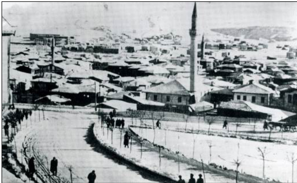
Figure 4. Altındağ and Hacettepe district in the past

The new regime in 1950's conducted radical and functionalist modernist decisions upon the cities which sometimes demolished the historical and traditional districts arrived from the new city development strategy. According to this political ideology, Hacettepe was recognized as a barrier due to its problematic structure which hinders to apply modern urbanisation decisions in the city centre. Hacettepe which was perceived as a marginalized and problematic region by the political authority experienced the modernist ideology reflections which would have extreme changes on people's lives living in and around the district.