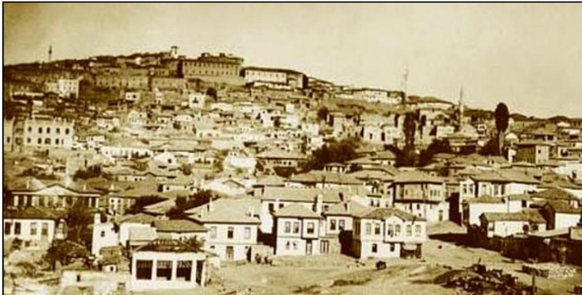
Figure 2. Altındağ and the Traditional Ankara Houses, in 1929

As aforementioned before, archaeological findings have revealed that Hittites, Frigs, Lydian and Galats had settled in different periods in the historical part of Ankara (Ulus-Altındağ). The historical pattern (which dates back to 15 th century) and the cultural features of the Hacettepe district along with its geological characteristic (which indicates a hill in Altındağ) makes the region a valuable and beautiful place (Figure 2) (Vural, 2007). In the Ottoman period, population of Ankara was estimated about 25.000 at the end of the 16 th century. Hacettepe district was assumed as one of the crowded areas in the city centre. Hacettepe district, which consisted of İmaret-i Karacabey neighbourhood and Hacı Musa neighbourhood, was located nearby city walls (Faroqhi, 1987). Until the beginning of 17 th century, this district was named as Hacı Tepesi ; however, its name was changed and Hacettepe name has started to be used because this area had a function as namazgah (Şenol & Cantek, 2007). Hacettepe word connotes to an area where God corresponds and accepts your prays about your needs, hopes and requirements.