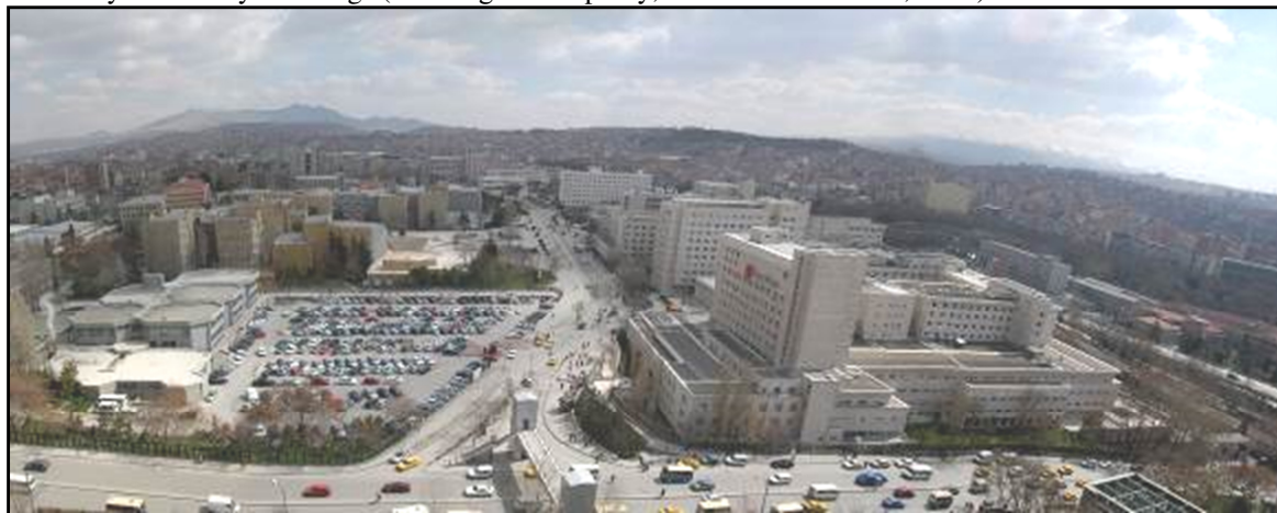
Figure 8. Today's View of the Hacettepe District and Hacettepe University City Campus (Hacettepe University, The Archives of Directorate of Construction and Technical Works, 2007)

commercial units (Kurtar, 2012). Thus, most of the buildings have lost their originality in terms of form and function. Some of the buildings were demolished because of the Hacettepe Hospital construction. Those were the ones located in block number 356 (covering plots of 1-6 and 8) (Kurtar, 2012). The buildings located beside the Sarıkadı Mosque in the block 357 (plots of 1, 2, 4 and 40) were also demolished in order to construct Hacettepe University Dormitory Buildings (Altındağ Municipality, 2008 cited in Kurtar, 2012).