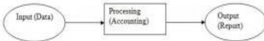
Figure 1. The relationship between the three stages of data processing

In discussing the three stages of data processing - input, process and output - one can observe the difference between a computerized accounting system and a manual accounting system ( http://www.sharepointsecurity.com 2015).