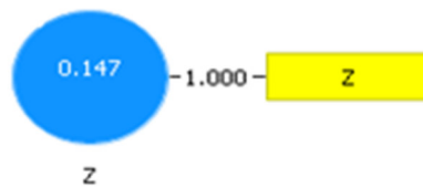
Fig. 2: Outer model of Market Reaction Variable

The results of calculations for the measurement model variable of market reaction can be described as follows: