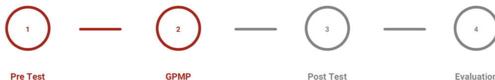
Figure 2. Evaluation Process GPMP

Based on Figure 1.1, HCD has designed 18 (eighteen)-development program and handed over 5 (five) development program to Leadership Academy, which are Great People Development Program (GPDP), Great People Managerial Program (GPMP), Global Talent Program (GTP), Business Simulation and International Class. Referring to the explanation of the theme, namely "Evaluation of Leadership Training Program Using Kirkpatrick Model". This research will explore about the evaluation leadership training of GPMP 4 2018 in Telkom Corporate University. At the end of this discussion, we will find out whether there has been a comprehensive evaluation or not based on the improvement of employee performance towards individuals, groups & departments.