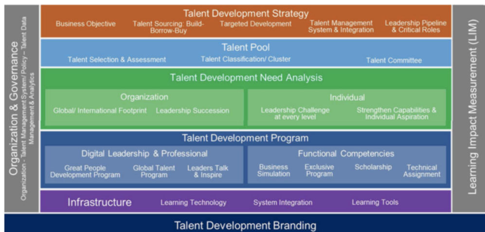
Figure 1. Telkom Talent Development Framework

Based on Figure 1.1, HCD has designed 18 (eighteen)-development program and handed over 5 (five) development program to Leadership Academy, which are Great People Development Program (GPDP), Great People Managerial Program (GPMP), Global Talent Program (GTP), Business Simulation and International Class. Referring to the explanation of the theme, namely "Evaluation of Leadership Training Program Using Kirkpatrick Model". This research will explore about the evaluation leadership training of GPMP 4 2018 in Telkom Corporate University. At the end of this discussion, we will find out whether there has been a comprehensive evaluation or not based on the improvement of employee performance towards individuals, groups & departments.