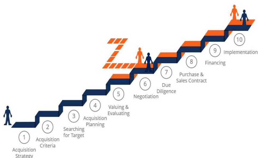
Figure 2: The steps for a completed and successful Merger and Acquisition

Source: https://corporatefinanceinstitute.com/courses/advanced-financial-modeling-mergers-acquisitions/