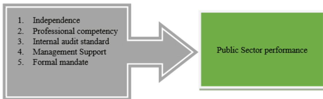
Figure 1. Conceptual Framework of the Study

This section provides a conceptual frame work for this study based on literature review. It explains the key variables and relationships variables. It assumes that