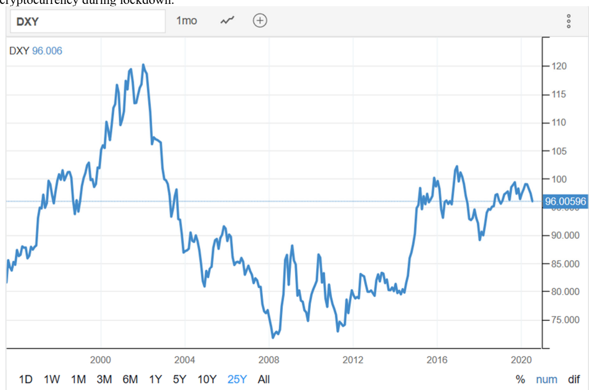
Table 10 Table 5.1 shows the effect of activities of the US dollar. Notice the deep fall in 2008. It is highly possible the deep fall was due to the financial crisis in 2008. Despite the coronavirus in 2020, it is expected that it would have little to no effect on the dollar at the end of 2020 even though there have been increased transactions in cryptocurrency during lockdown.